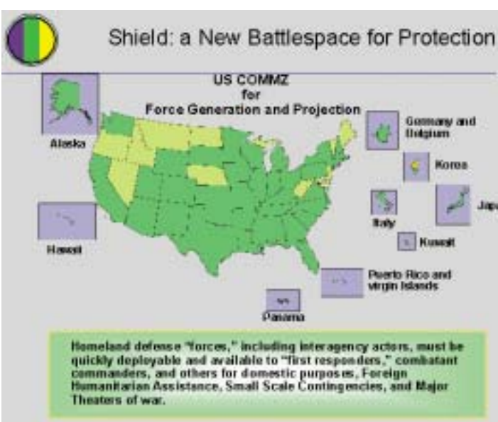
Homeland Defense US Army Training and Doctrine Command